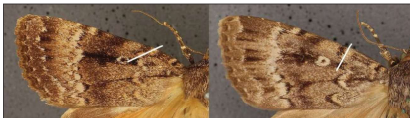
Plate 10. Forewing upperside angle of antemedian line at one-third costa.

A useful characteristic if the angle is in line with the discal spot in A. Pyramidea and in-line with the 2 ventral peaks in A. berbera . However, the angle varies widely in both species making it of limited use if the above criteria are not met. The overall reliability of this characteristic was 66.83%.