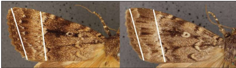
Plate 12. Forewing upperside convergence of postmedian line and termen.

The overall reliability of this characteristic was 85.43%. An approximate straight line from the apex to the termen on both species should be relatively straightforward to envisage while the mean straight line of the postmedian line may be open to interpretation. In A. pyramidea the two straight lines converge from the costa to the dorsum, while in A. berbera the two straight lines are relatively parallel. While this convergence is relatively stable in A. pyramidea in good to excellent condition, it varies widely in A. berbera irrespective of condition to the point the characteristic purports to A. pyramidea . Reliability drops off significantly in worn specimens.