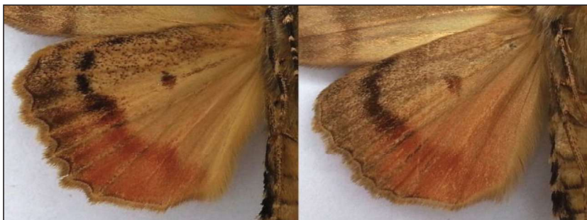
Plate 20. Hindwing underside. Les Evans-Hill.

Hindwing morphology was among the features used to add A. berbera to the British fauna; however, only the intensity of copper on the hindwing upperside was described (Fletcher, 1968). It was not until a year later that differences with the hindwing undersides of A. pyramidea and A. berbera were discovered (Goater & Christie, 1969). The differences were described as follows: “(i) the wings of berbera are drab and smooth in texture, whereas those of pyramidea are bright with contrasting pattern and are ‘rough’ with a peppering of dark scales which are particularly evident towards the anterior margin of the hindwings. We would say that these scales are always present in pyramidea and that it is rare to find them in berbera . Only in very worn specimens is it difficult to decide whether or not these scales are present.