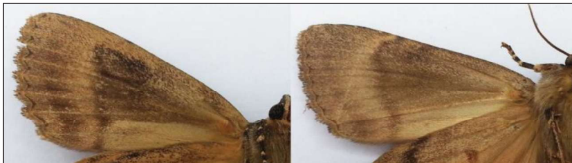
Plate 8. Forewing underside. Les Evans-Hill.

The forewing underside is more difficult to view than the hindwing underside and cannot be viewed easily in a glass container as it is obscured by the hindwing. However, with careful handling it can be viewed along with the hindwing underside. The dark suffusion from the base to the postmedian line in A. pyramidea is generally glossy, straw-coloured and does not extend to the costa. In A. berbera it is duller and almost uniformly fuscous-shaded and usually extends to the costa. The overall reliability of this characteristic was 85.8%. It scored 100% in A. pyramidea in pristine condition. The reliability dropped significantly with wear in A. pyramidea making the feature difficult to distinguish from A. berbera , in which this characteristic scored consistently <90% irrespective of condition.