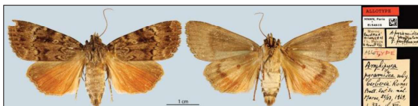
Plate 4. Amphipyra pyramidea subsp. berbera ♀ allotype. MNHN Marion DEPRAETRE -2019.