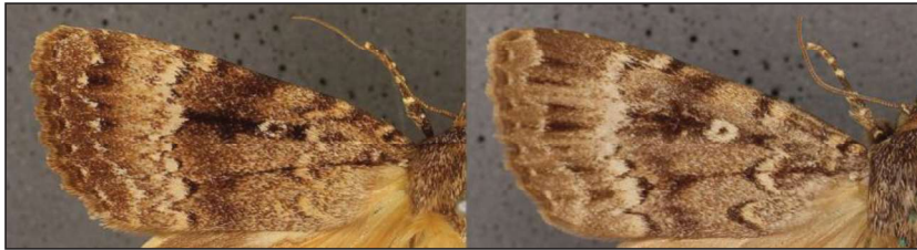
Plate 17. Forewing upperside overall appearance.

A. pyramidea is generally brighter, crisper, glossy and contrasting while A. berbera is overall duller and less contrasting. This characteristic is also commonly used in Britain and with A. berbera being previously known as the dusky or drab copper underwing it is understandable why it is often referred to; however, worn A. pyramidea can easily purport to A. berbera . Although for A. pyramidea in pristine condition a score of 100% was achieved, the score for A. berbera was inconsistent throughout. The overall reliability of this characteristic was 46.49%.