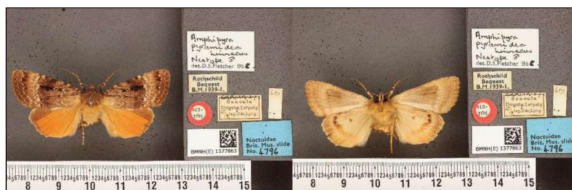
Plate 2. Amphipyra pyramidea ♂ neotype.