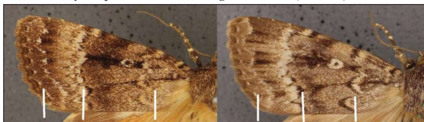
Plate 15. Forewing upperside measurement by ratio of division of antemedian line and tornus by the postmedian line along the dorsum.

This method measures the ratio of division of the antemedian line and tornus by the postmedian line along the dorsum. It is ~1:2 in A. pyramidea and ~1:1 in A. berbera . The overall reliability of this characteristic was 76.89%. This method works better the shorter the distance between antemedian line and postmedian line along the dorsum which makes the “ratio of division” suggest A. pyramidea ; however, this characteristic in A. berbera varies widely and in some specimens will purport to A. pyramidea . Reliability was inconsistent across all conditions due to the variability in A. berbera .