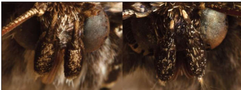
Plate 6. Colouration of the scales of the ventral face of the labial palpi. Ben Smart.

The labial palpi characteristic is used with regularity in Britain and too often as the only method of determination. Plant (2008) has shown that the extent of white on the labial palps (referring to Winter (1988) and “subsequent plagiarists”), is known