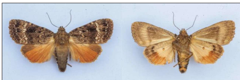
Plate 1. Amphipyra pyramidea ♂. Les Evans-Hill.

The “Dusky/Drab Copper Underwing” or “Svensson’s Copper Underwing” was originally described as subspecies berbera of A. pyramidea (Plate 4) by Rungs. In 1967, Ingvar Svensson recognised that there were two externally similar species that differed in their genital morphology [Rungs described the genital parts as conforming to pyramidea ] being confused under the name of A. pyramidea . He wrote to the Natural History Museum in London with his findings and as a consequence, berbera (Plate 5) was redefined as a valid species (Fletcher, 1968). The status of A. berbera as a distinct species is supported by mitochondrial COI “barcode” data (Chen et al. , 2013). A. berbera is widespread across much of central and southern Europe, parts of North Africa and Asia Minor. It is known from Scandinavia where like A. pyramidea it is expanding, but not as quickly (J. Kullberg, pers. comm.). In Britain