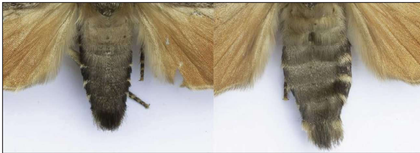
Plate 7. Contrast of the abdominal lateral chequered marking. Les Evans-Hill.

Described as a contrast of pale straw and black in A. pyramidea , and fulvous and black in A. berbera (Goater & Christie, 1969). In essence, it is more contrasting in A. pyramidea , weakly-chequered black with thin band of pale straw scales at each abdominal segment, while less contrasting with strongly-chequered black and fulvous scales in A. berbera . The reliability of this characteristic was inconsistent irrespective of condition due to subtle variations in both species, though the overall reliability was 84.11%.