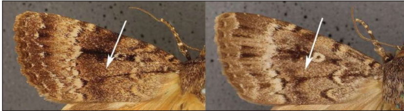
Plate 16. Forewing upperside median contrast.

The similarities and variability of shading and contrast both species made this characteristic unreliable, increasingly so with wear. The overall reliability of this characteristic was 57.23%.