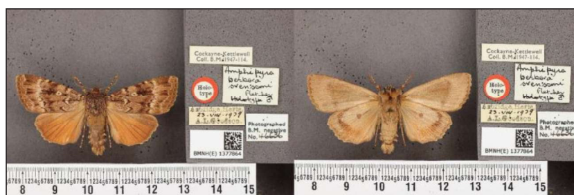
Plate 5. Amphipyra berbera svenssoni ♂ holotype.

(Map 2) it is considered widespread across England, less so in Wales where it is expanding. It is local in Scotland, expanding through south-east and central parts. It is not known in Ireland. Due to identification difficulties the true distribution in Britain is not known. It has one generation, flying earlier than A. pyramidea from mid-July (later in Scotland) through to late October.