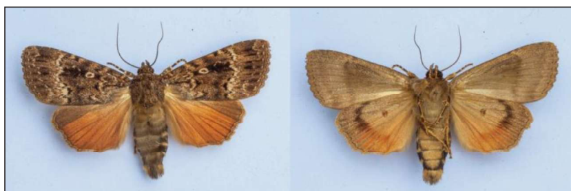
Plate 3. Amphipyra berbera ♀. Les Evans-Hill.