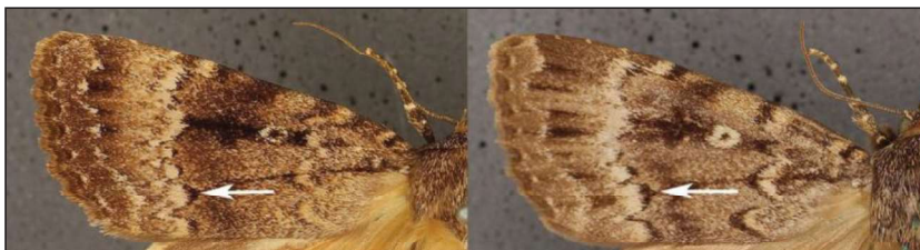
Plate 18. Forewing upperside postmedian line, second-most ventral peak shape.

A very subjective character. The overall reliability of this characteristic was 64.34%.