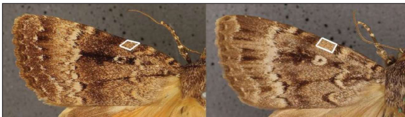
Plate 19. Forewing upperside shape of lighter area between costa and the discal spot.

The lighter area between the costa and the discal spot forms a rhombic in A. pyramidea and a square in A. berbera . The overall reliability of this characteristic was 57.92%. The shape of this characteristic will be influenced by the angle of antemedian line at one-third costa; however, the similarities and variability of both species made this unreliable and almost impossible to use in worn specimens.