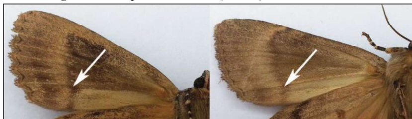
Plate 9. Forewing underside postmedian line. Les Evans-Hill.

The forewing underside postmedian line is almost straight and does not reach the costa in A. pyramidea and is more curved with a pronounced inward curve at the costa in A. berbera . The overall reliability of this characteristic was 76.11%. It scored 100% in A. pyramidea in pristine condition; however, the reliability dropped significantly with wear as the postmedian line starts to purport to either species. The overall reliability in A. berbera was <77%.